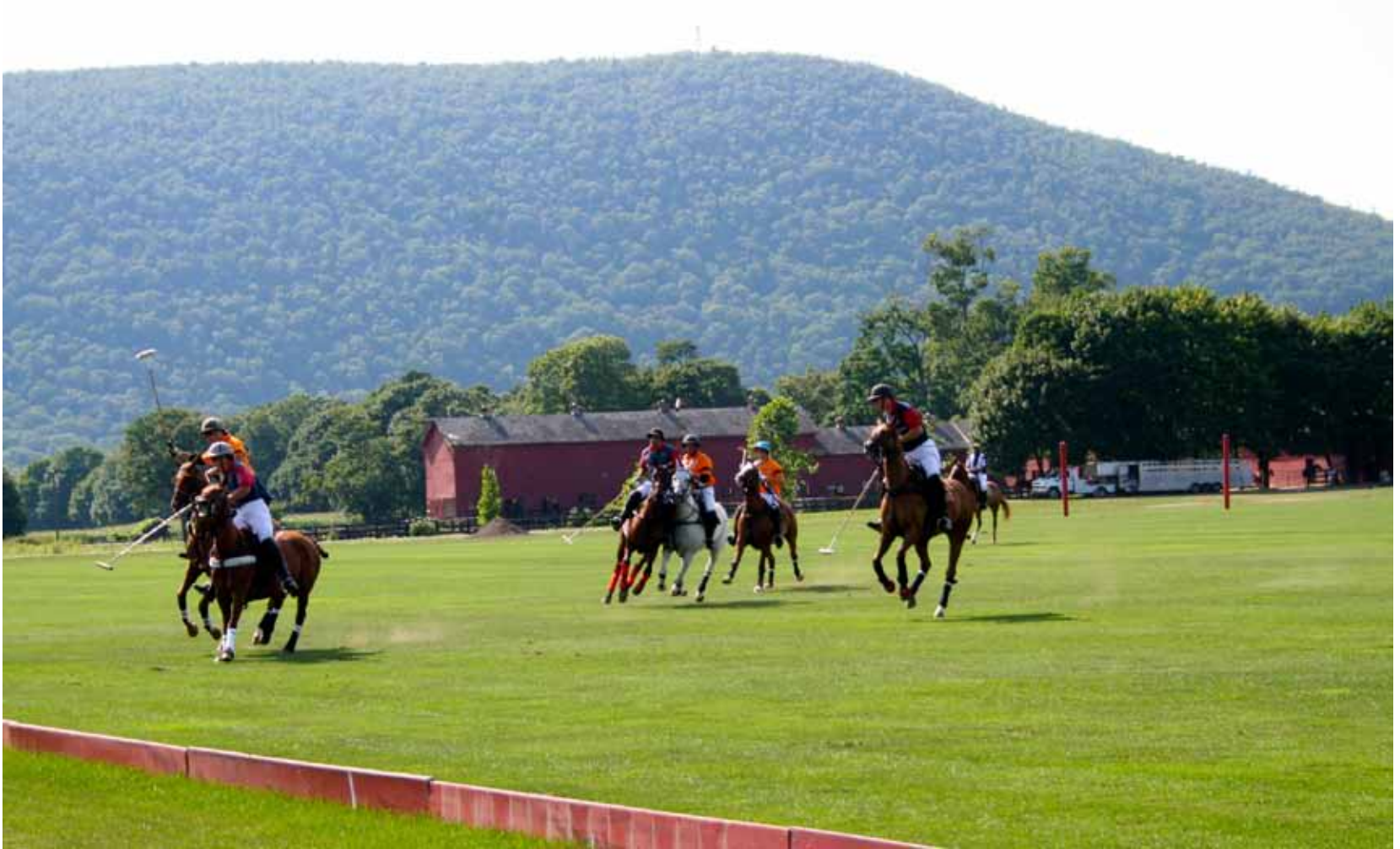
Above, scenic Mashomack on a lovely Summer day. Below, action in the final.